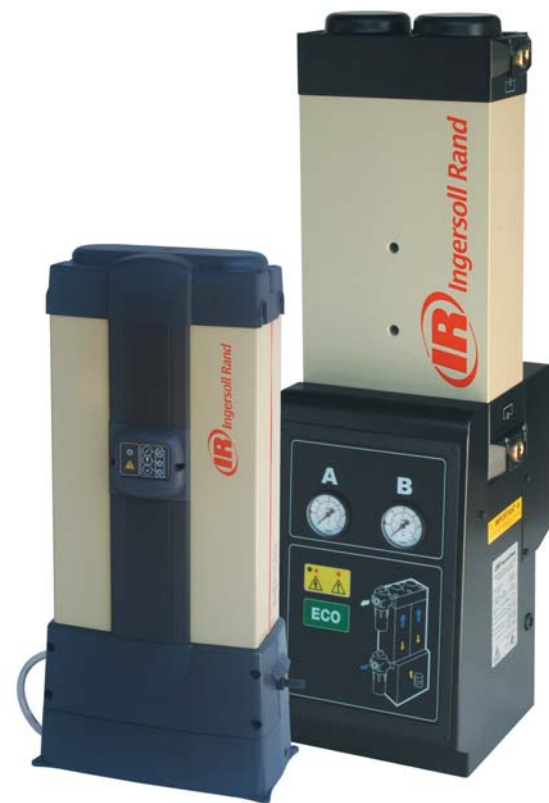
D51M to D341M Modular Dryers

Our dryers feature standard ISO Class 2 dewpoint performance, with optional ISO Class 1 to meet the most stringent requirements. This helps prevent corrosion and minimizes production disruptions or losses due to moisture or contamination. And easy on-site maintenance – less than 15 minutes after 12,000-hours of use – gets you back on line quickly.