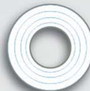
Typical cross-section of an NL Module

Deep-bed filtration provides more surface area for the highest coalescing efficiency