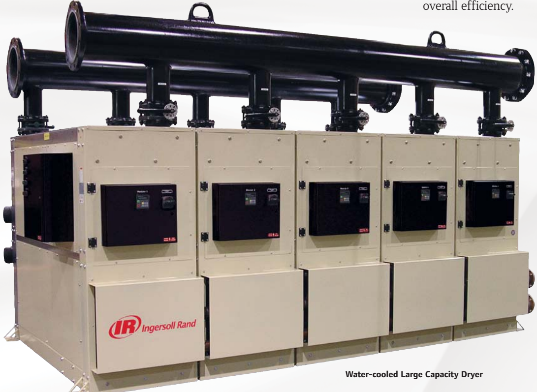
Expandable Large Capacity Dryers feature a modular design and individual controllers that provide redundancy for models starting at 3,250 SCFM.

Clean, dry compressed air is warmed as it exits the dryer to prevent pipe sweating and to condition it for application. The refrigeration system in each module automatically cycles as needed to maintain cold stored energy, while active circulation of the thermal mass cold storage media contributes to the dryer's overall efficiency.