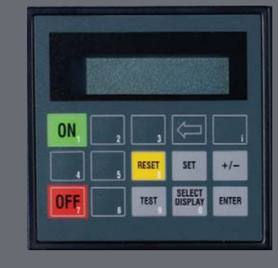
Controller for NVC1000 and larger